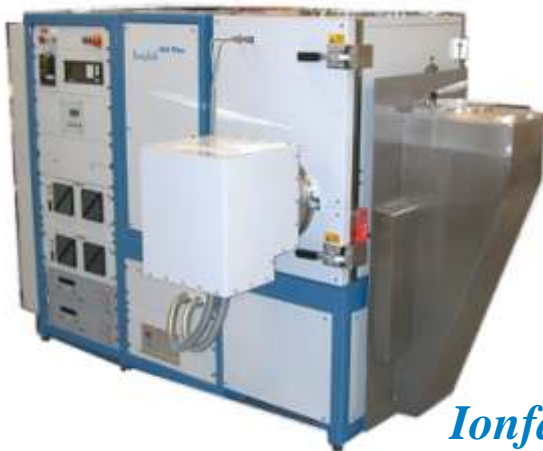
Ionfab 300 Plus