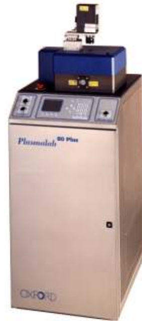
Plasmalab 80 Plus