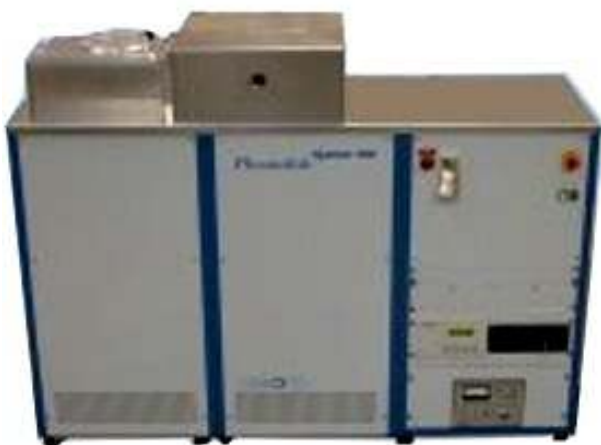
Plasmalab System 133